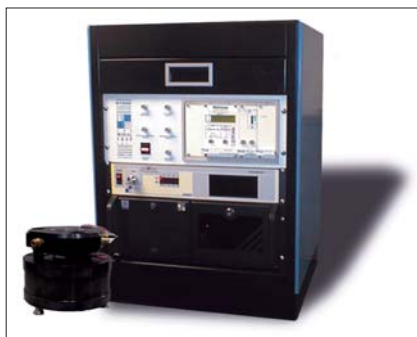
Figure 1. Accelerometer calibration workstation next to an electrodynamic air bearing calibration shaker. 1

Printed calibration certificates fulfilling the requirements set forth by ISO 17025 can be easily generated, and cali-