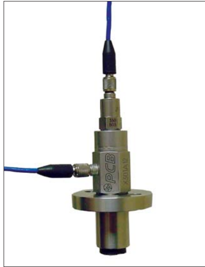
Figure 4. Test transducer, reference transducer, and anvil mounting arrangement.

Other methods of shock calibration include well-described Hopkinson bar systems, which are particularly suitable for