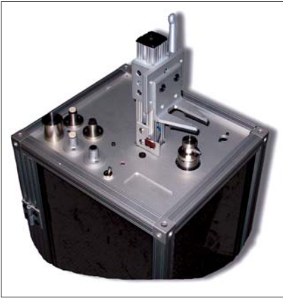
Figure 3. 9155C-525 pneumatic shock exciter.

bration results can be stored in open database format for ease of retrieval and data management. The system can also test accelerometers for other characteristics, such as zero shift, ringing and nonlinearity. Figure 5 shows a typical screen shot of the measured shock and the calibration results produced with the pneumatic exciter described above.